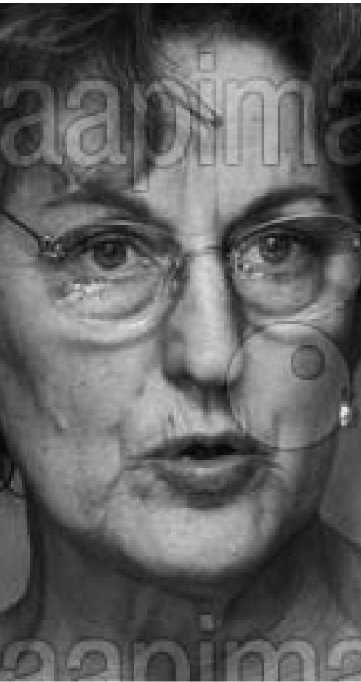
THE FEMINIST: GERMAINE GREER

It's not everyday that someone in your life chooses to become your mentor through everyday happenings, like work and your relationships with family, friends and loved ones. While the mentor won't come knocking on your door they can enter your life when you open yourself up and put yourself "out there" – you attract great people by being the greatest you can be. Here are six women who have led successful lives in their individual ways and in different working fields. Use them as your mentors and be enriched and inspired by their stories.